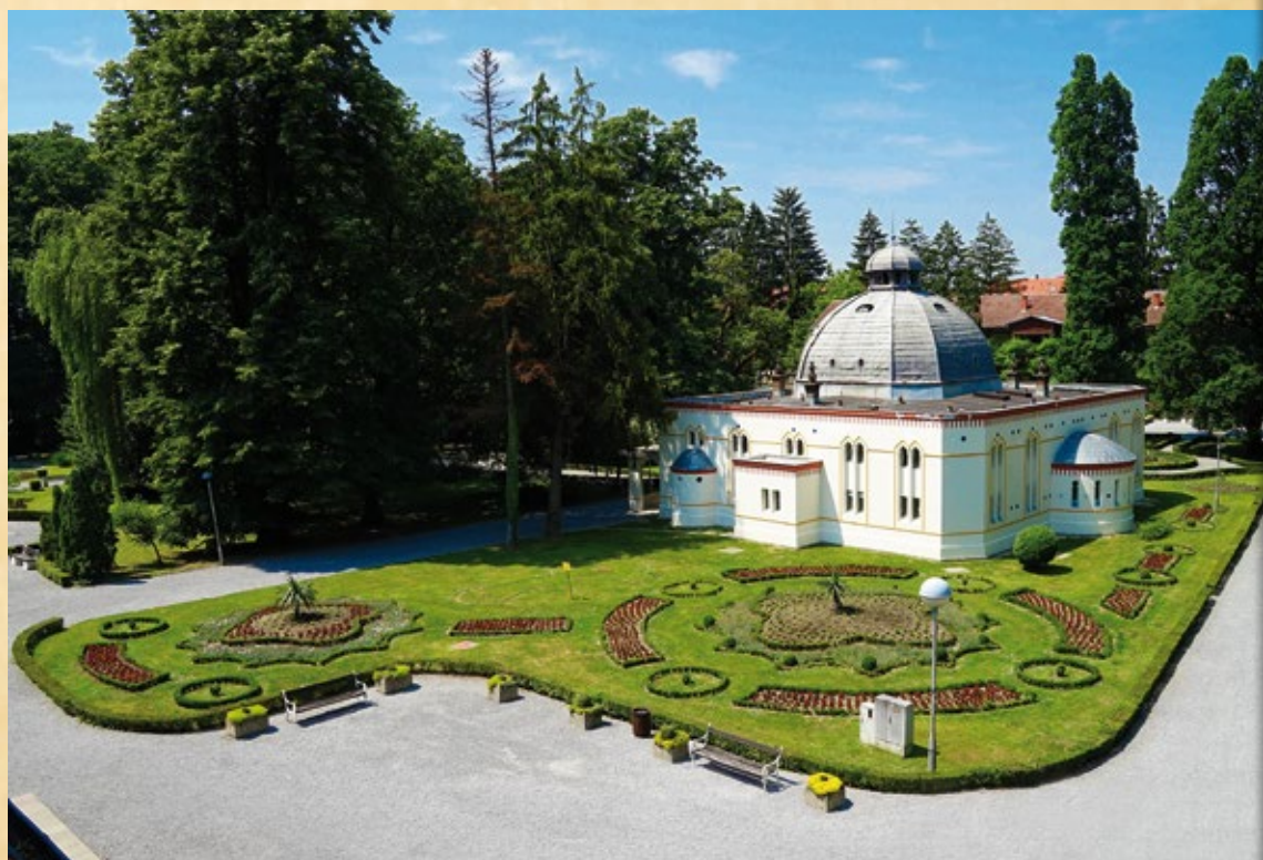
Daruvar SPA, Central mud bath