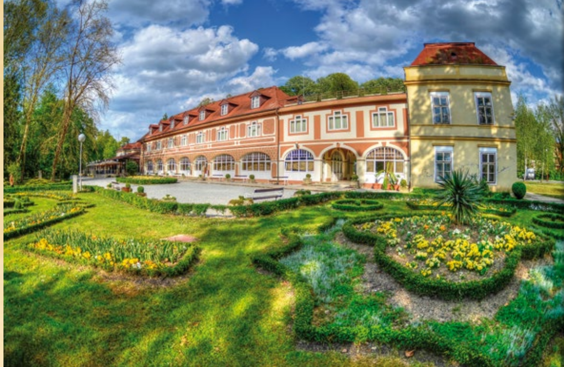
Daruvar SPA , Vila Arcadia